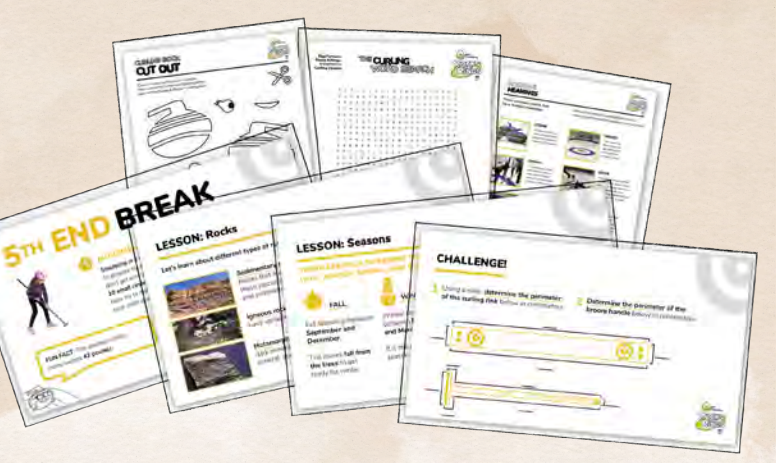
Rocks & Rings In the Classroom curriculum-based digital learning module

It wasn't only a successful year of maintaining stability within the program; the program itself saw massive growth. Between in-classroom learning, virtual sessions, and 1,113 days of curling programming in school gyms, more than 305,000 students were reached during the school year, far surpassing past retention figures.