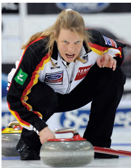
In 2010, Germany's Andrea Schöpp won her second world title. The veteran skip has made a record 19 world appearances and has recorded 110 wins.