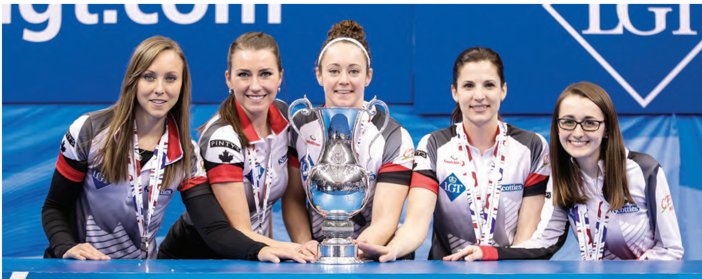
In 2017, Rachel Homan, Emma Miskew, Joanne Courtney, Lisa Weagle and Cheryl Kreviazuk ended the longest gold-medal drought for Canadian women's teams — eight years — and became the first team in the history of the world women's to run the table, going 13-0.