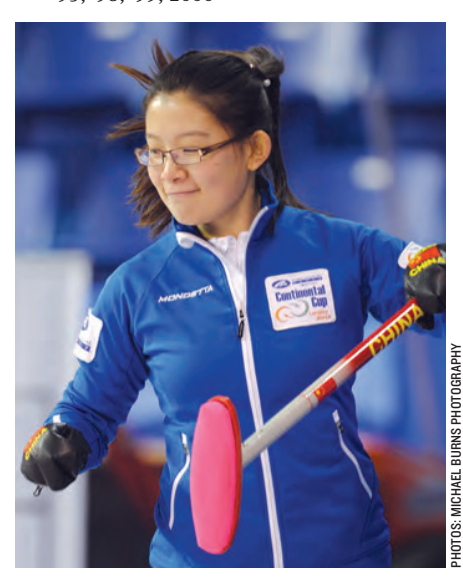
Skip Bingyu Wang of China first appeared in a world women's curling championship in 2005, and played in 10 of them before she was done.